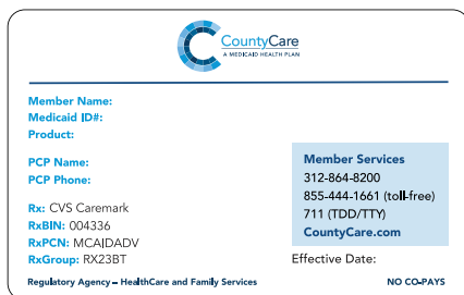
Front of Card

Always carry your CountyCare ID card with you. Show it every time you get care. You may have problems getting care or prescriptions if you do not have your ID card with you. If you have other health coverage cards, bring them with you too.